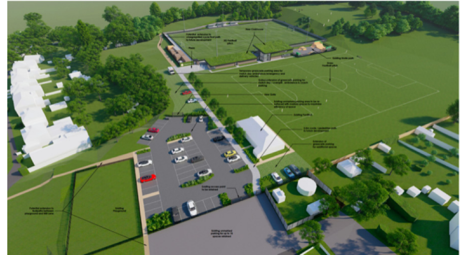
An artist's impression of plans for the new stand at Greatness Park