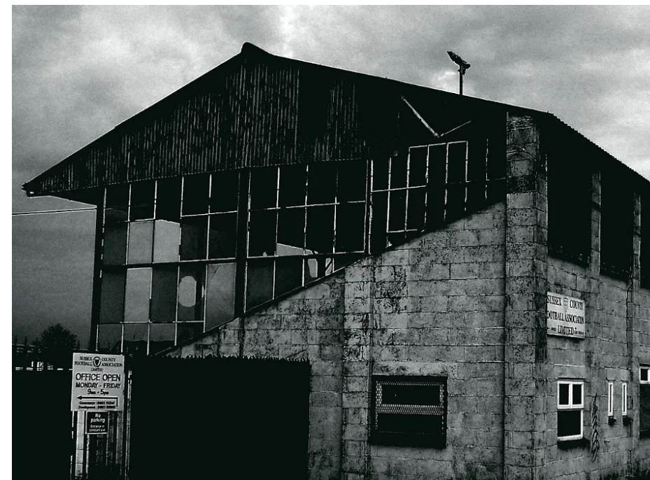
We'll take any excuse to show this classic Gothic image of Lancing's stand again ...