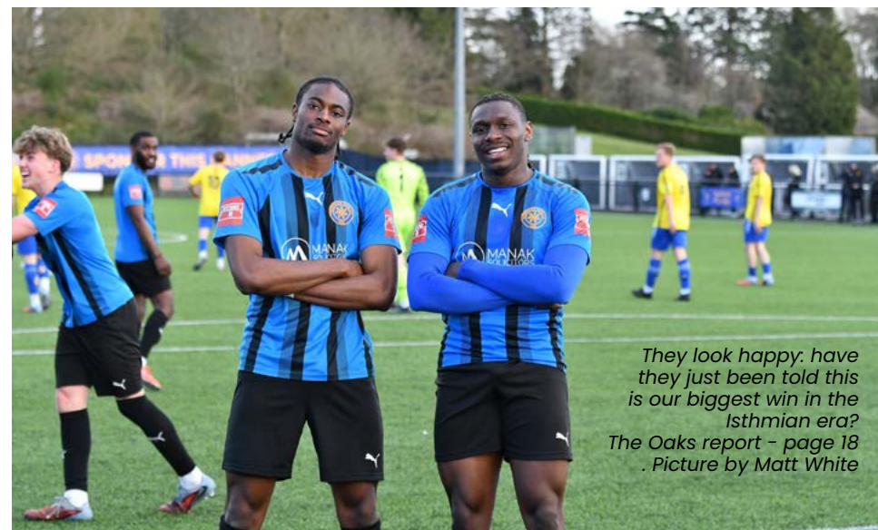
They look happy: have they just been told this is our biggest win in the Isthmian era? The Oaks report - page 18 .