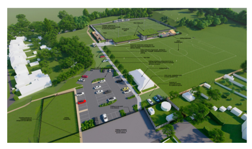
An artist's impression of plans for the new stand at Greatness Park