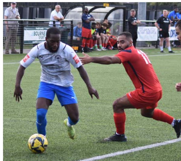
Action shot from Saturday's 3-0 win over Colliers Wood United

The only league fixture was at Three Bridges , where two late goals saw the home side complete a 4-2 win over Phoenix Sports . Leighton gave Bridges and early lead and scored again after Mills' equaliser. Hayes made it 2-2 before half-time before Difika struck twice in the final eight minutes.