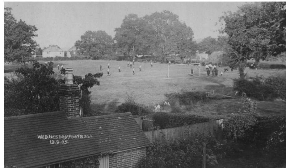
An image from East Grinstead's website showing football in the town, dating back to the 1900s

They were promoted back to Division One in 1993, but lasted just two years.