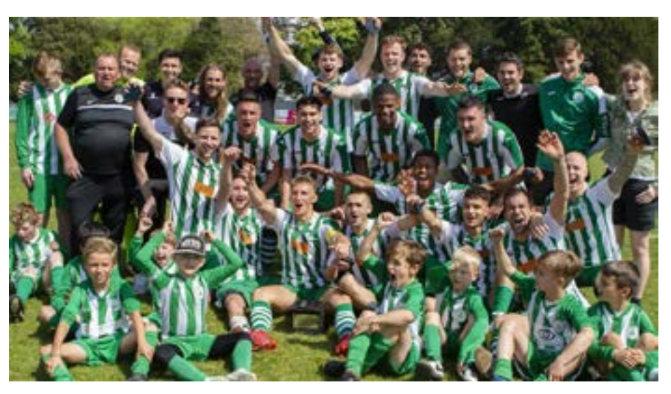
City celebrate winning the SCFL in 2019

The club also won the Brighton Charity Cup in 2005 and 2006 and the RUR Cup for a third time in 2007 . At the start of the 2009–2010 season, following discussions with Chichester District Council, it was agreed to revert back to the name of Chichester